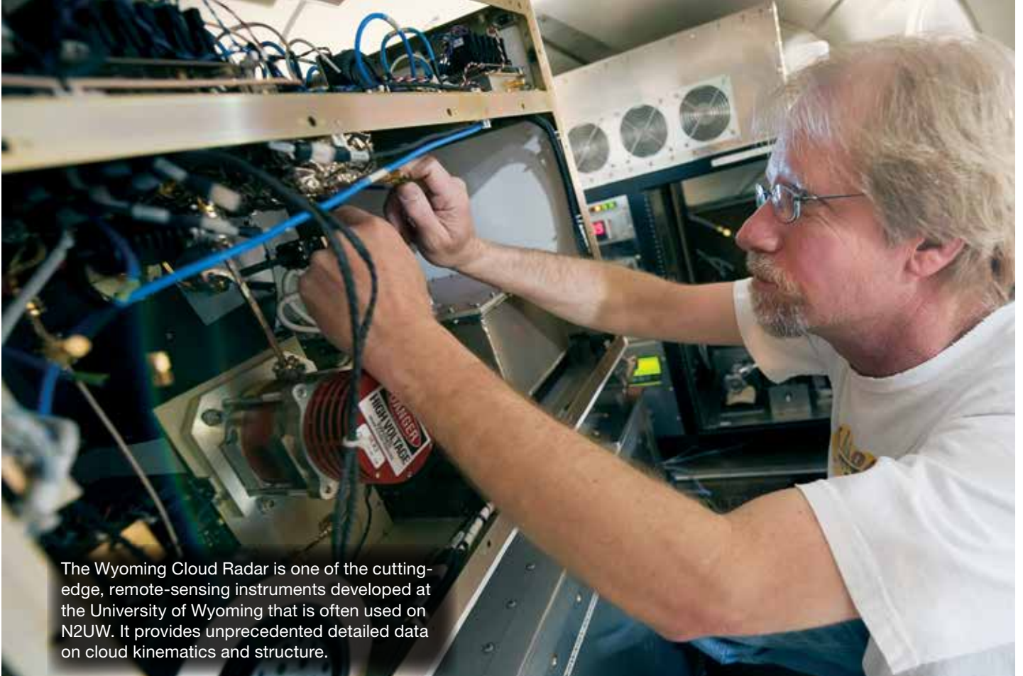
The Wyoming Cloud Radar is one of the cutting-edge, remote-sensing instruments developed at the University of Wyoming that is often used on N2UW. It provides unprecedented detailed data on cloud kinematics and structure.