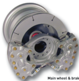
Main wheel & brake/ Rodas e freios principais Kit P/N 199-90

The tax legislation does repeal the “like-kind” exchanges for business property, in which businesses could defer taxes on sales of equipment if they were purchasing new equipment. According to the NBAA, it “plans to work through a broad coalition to seek an extension of immediate expensing and the reinstatement of like-kind exchanges of business equipment.”