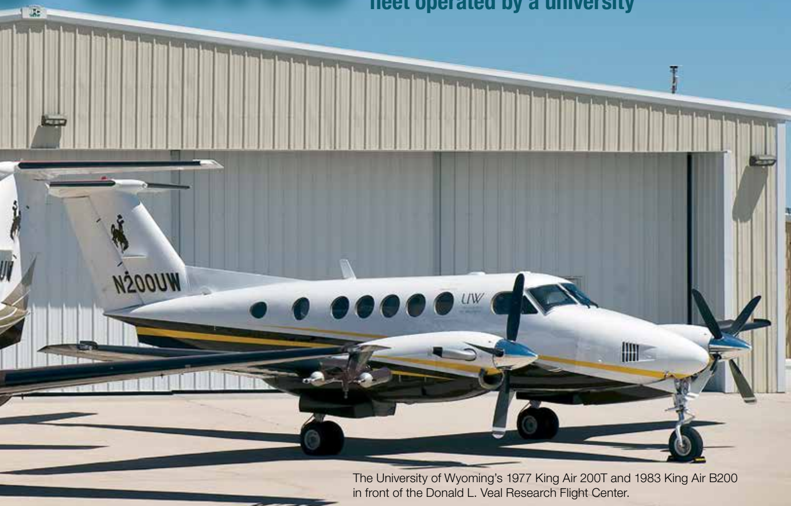
The University of Wyoming's 1977 King Air 200T and 1983 King Air B200 in front of the Donald L. Veal Research Flight Center.

UW's King Air 200T is the only atmospheric research aircraft in the National Science Foundation-supported fleet operated by a university