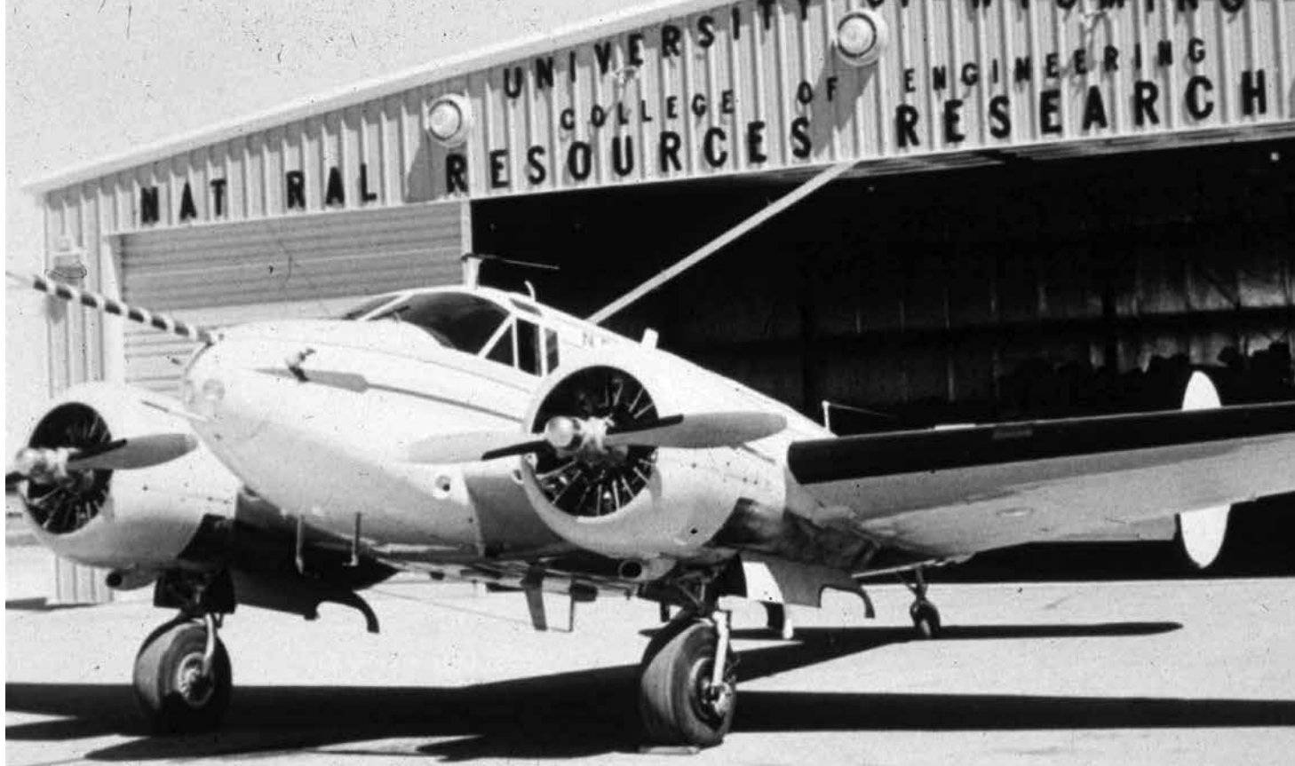
The Department of Atmospheric Science at the University of Wyoming has operated aircraft for atmospheric research for more than 50 years, starting with this twin-engine Beechcraft C-45 acquired in 1965.

A quarter of N2UW's projects are in support of Wyoming faculty using funding from other agencies. The university has other atmospheric science assets as well: the Wyoming Air Quality Assessment Monitoring Laboratory and the Mobile Air Chemistry Laboratory, a heavily instrumented Sprinter van, are used for mobile and longer-term monitoring and observation. Together, the laboratories and the King Air facilitate the gathering of and interpretation of atmospheric measurements directly relevant to the state and region.